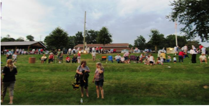
The crowd begins to gather for the July 30 th concert.