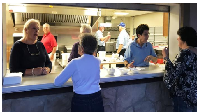
Refreshments were provided by volunteers from Pfoutz Valley United Methodist Church.