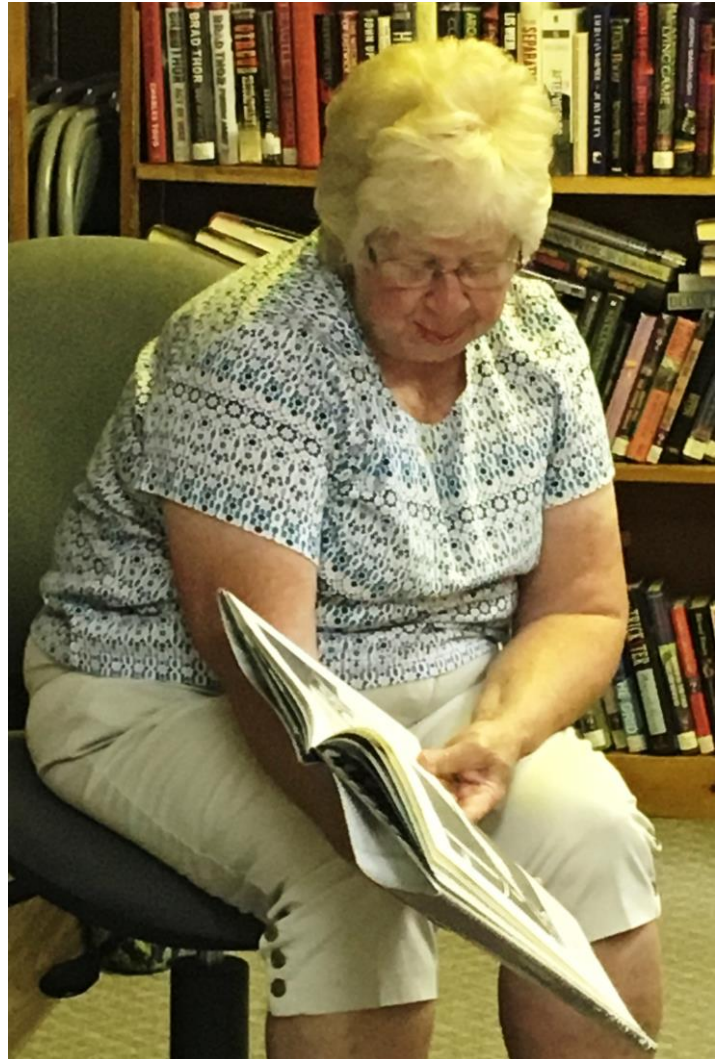
Perry Valley Grange contributed $500 to purchase books + provided readers for the reading program.